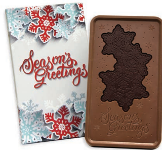
Item #316003 Season's Greetings/Snowflake 1 lb. Combo Bar Case of 5: $153.34 ($30.67 ea)/R