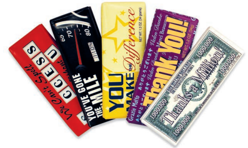
Item #350005 Employee Recognition Assortment Case of 50: $136.08 ($2.72 ea)/R

STOCK COLLECTION ITEMS ARE READY TO SHIP IN 3 WORKING DAYS OR LESS! HOLIDAY • THANK YOU • RECOGNITION • TAX SEASON • SAFETY & HEALTHCARE • GIFT BOXES & BASKETS