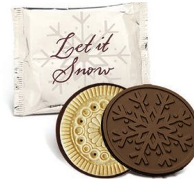
Item #320410 Snowflake Dark Chocolate Cookies Case of 50: $132.93 ($2.66 ea)/R