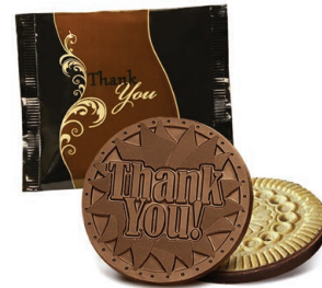
Item #320490 Thank You Milk Chocolate Cookies Case of 50: $132.93 ($2.66 ea)/R