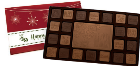
Item #302135 45-Pc Holiday Chocolate Assortment Case of 5: $207.90 ($41.58 ea)/R