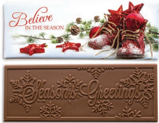
Item #310053 Santa Boots Milk Chocolate Bar Case of 50: $126.63 ($2.53 ea)/R

Visit our website for dozens of Ready to Ship Options!