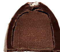
SEA SALT CARAMEL