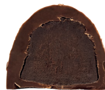
CHOCOLATE on CHOCOLATE